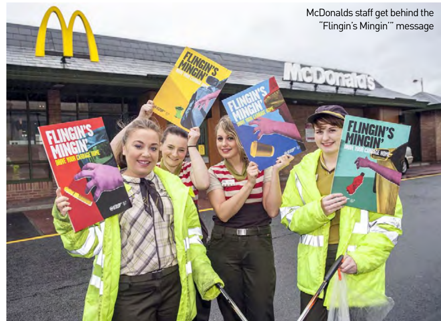
McDonald's staff get behind the "Flingin's Mingin" message

That's exactly what McDonald's does. The company's daily Scottish Litter Patrols cover a minimum of a 150-metre radius around each restaurant and collect all litter, not just McDonald's packaging. Crew members across the UK cover a total of 3,000 miles each week.