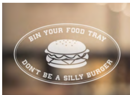
A window sticker with a strong message can also be effective.