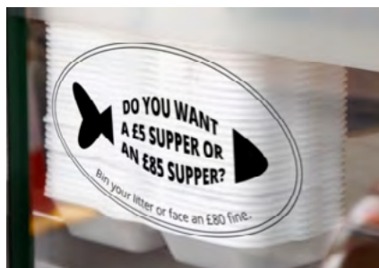
You can always give the 'put your waste in the bin' messaging more punch with the threat of a fine.