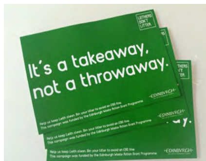
Leithers Don't Litter.

Or take this example from Leithers Don't Litter. The message, 'It's a takeaway, not a throwaway', has a slightly cheeky tone and clever wording, which makes these signs more effective than a simple 'no littering' message.