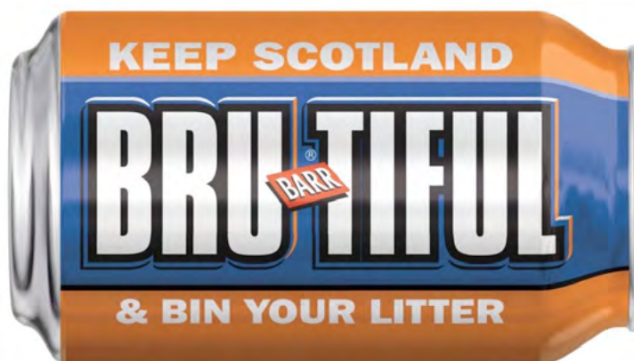
Keep Scotland BRU-TIFUL/ Clean Up Scotland